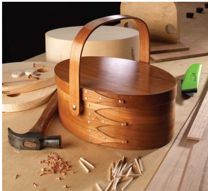
Swinging Handle Carrier