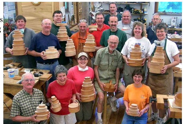
Great accomplishment in class